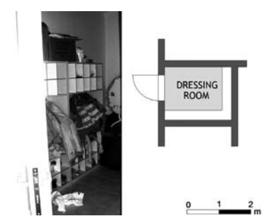
Figure 11. Dressing room found fearsome when the lights are off.

Figure 10. The staircase on which the children are afraid of falling when it is crowded.