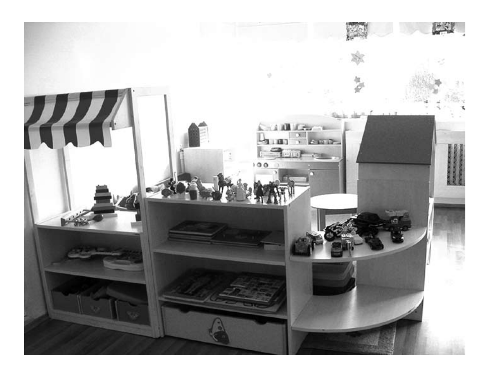
Figure 6. Location in a large classroom described as the family game corner.

the classroom. In contrast, location of toy racks all around small classrooms without being concentrated in a particular corner, and failing to delineate areas specifically allocated for playing, make it difficult for children in such classrooms to respond to this question. It has been observed that generally, boys and girls tend to prefer a location delineated by racks and chairs of their size to form a playing corner as their favorite place for games.