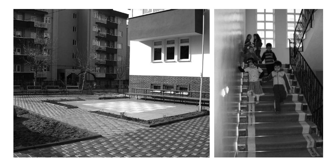
Figure 9. Planted areas upon whose borders the children indicated they could stumble.

Figure 10. The staircase on which the children are afraid of falling when it is crowded.