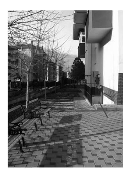
Figure 12. The stairwell that the children said they disliked because of the risk of falling down when playing in the garden flanking the building.

has no windows looking outside ( Figure 11 ). Even though this room was a small part of the large classroom, it was regarded as frightening because it did not receive natural light. The television room was larger, however because of its perception as always dark by the children, it was identified as frightening.