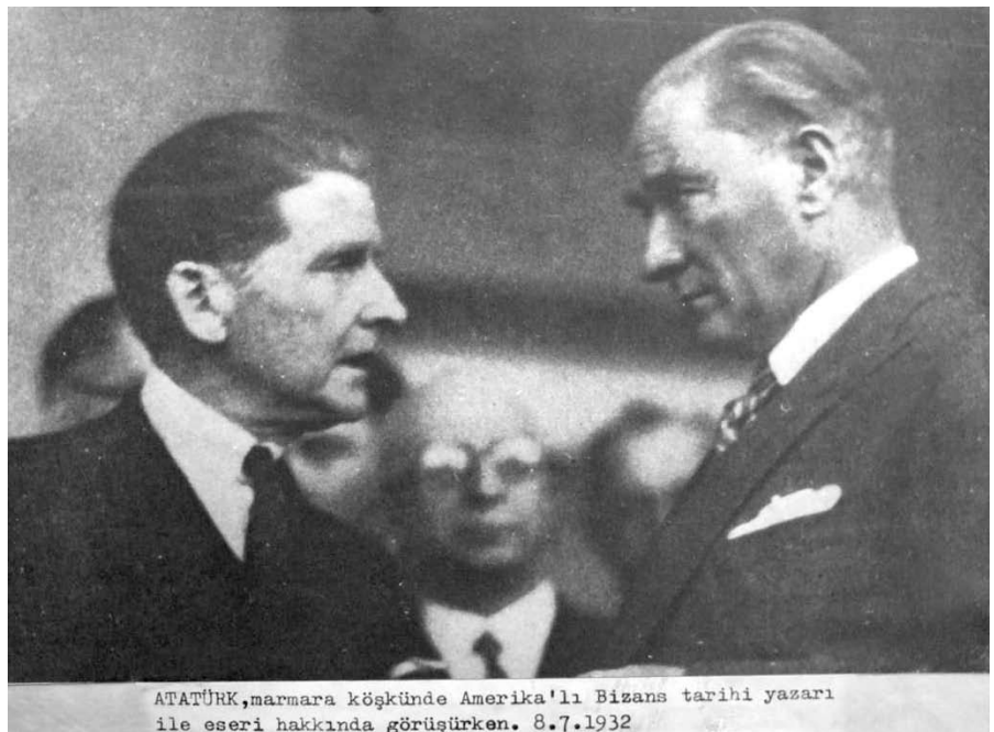
Figure 4. Thomas Whittemore and Atatürk (Milli Kütüphane, Atatürk Belgeği).

ATATÜRK, marmara köşkünde Amerika'lı Bizans tarihi yazarı ile eseri hakkında görüşürken. 8.7.1932