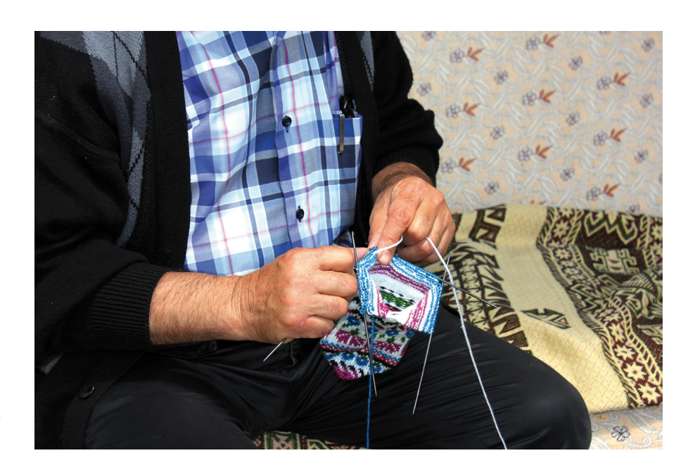
Figure 3. Y.A. Demonstrating sock knitting. He was taught sock knitting by his father (Photo: Aktaş, 2014).

shared our intentions of interviewing both female and male villagers before the field trip. Accordingly, the headman contacted our female interviewees, while male interviewees were randomly invited at the field, the first contact point being the village cafe. Our sample, therefore, is a purposive one in which, according to Uwe Flick (2009, 122), typical and convenient cases can be examined based on the time and space of the event taking place. Because our study's interviewees were contacted by the headman, we believe this study avoids sampling bias.