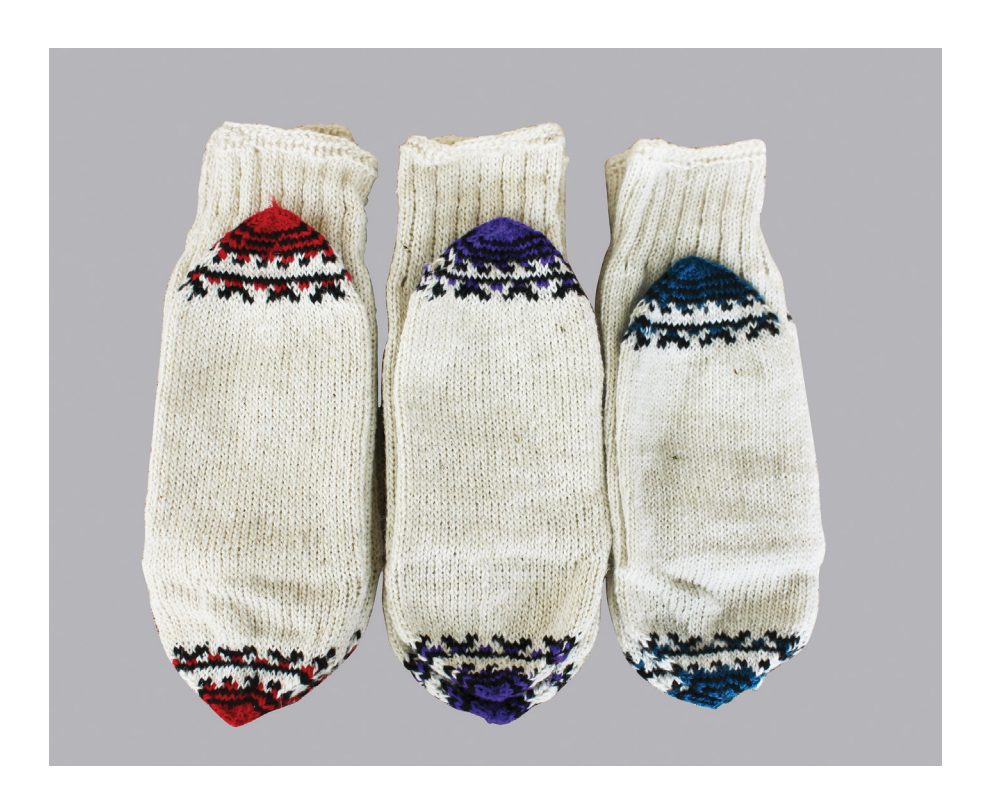
Figure 5. Drama socks made for women, knitted by H.P (Photo: Aktaş, 2014).

In addition to the change in knitting techniques, Yenikaraağaç also saw changes in the materials used to knit socks. Previously, craftspeople spun wool bought from wholesalers in Uşak, a city in western Turkey. Today, however, they either use mass-produced polyester yarns or buy handmade natural yarns made in Uşak. The disappearance of traditional features is related to the economic well-being of the villagers: a more labor-intensive process would increase the price of the product, which would be risky in a highly-competitive market with limited demand.