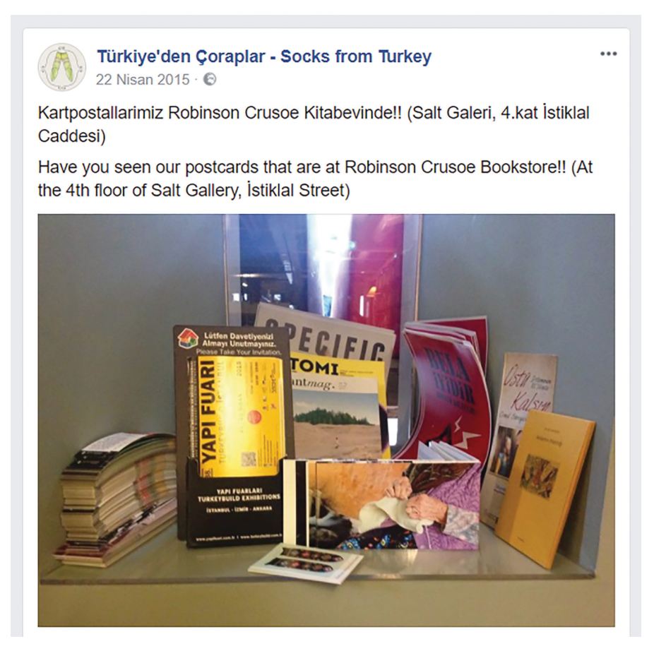
Figure 7. A snapshot from the Facebook page Socks from Turkey , depicting the postcards distributed to bookstores (Photo: Aktaş, 2015).

To monitor the impact of the postcards, a link to a previous online project was printed on the card. This previous project ( Türkiye'den Çoraplar/Socks from Turkey ) utilizes Facebook as a platform for archiving traditional handmade socks, enabling an online exchange of communication between