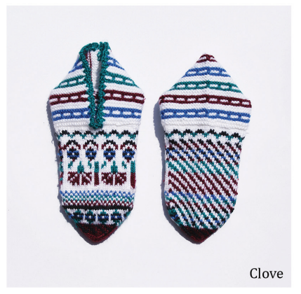
Figure 1. A selection of socks, made by h.A., An interviewee in Yenikaraağaç Village. Motifs: clove (left), rug pattern (center), hand in hand (right). Material: Polyester.

Due to their symbolic motifs, visual language, collective production process, advanced production techniques, and deeply-rooted history, handmade socks are not only a part of textile crafts but also the cultural heritage of Yenikaraağaç, as well as the whole of Turkey. Although wearing these socks has not been fashionable for a long time, they are still available in the commercial market, both in local and touristic shops. Handmade polyester or natural yarn socks featuring new or traditional motifs can be found in many shops ( Figure 1 ).