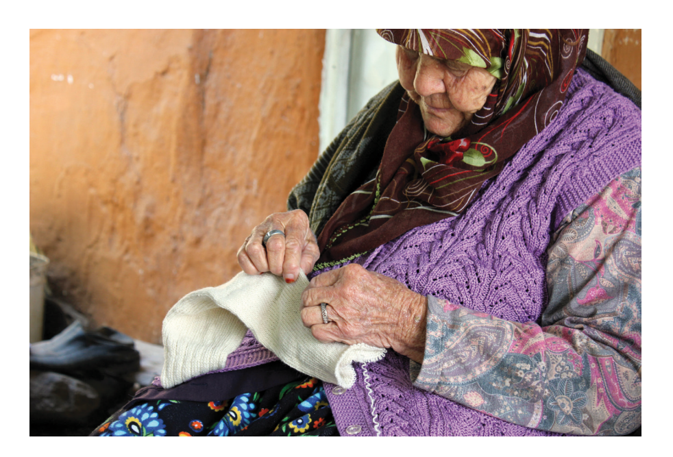
Figure 4. H.P. Knitting typical drama socks, named after the village from which their ancestors migrated

sock knitting, craftspeople typically work with intermediaries (Aktaş, 2016). Similarly, the two female interviewees, H.P. (born in 1930) and H.A. (born in 1954), reported working with intermediaries in order to sell their products. When asked about sock knitting, one of the female interviewees said (H.A., interview by the Aktaş and Veryeri-Alaca on June 2, 2014):